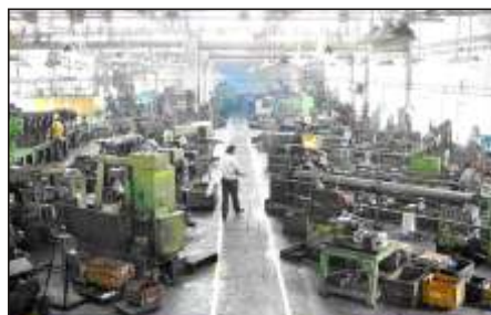
Inside view of PEASS Exports Factory

The company has representations in various countries through sales agencies.