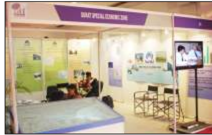
SURSEZ stall at IITF

expect a good number of these prospects to soon set up their units in the Zone.