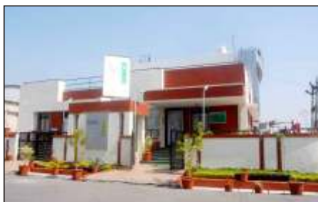
A view of the Grace Unit

During the Independence Day celebrations in August 2008, the Company along with DGDC and Customs officials celebrated Green Week by planting trees around the site.